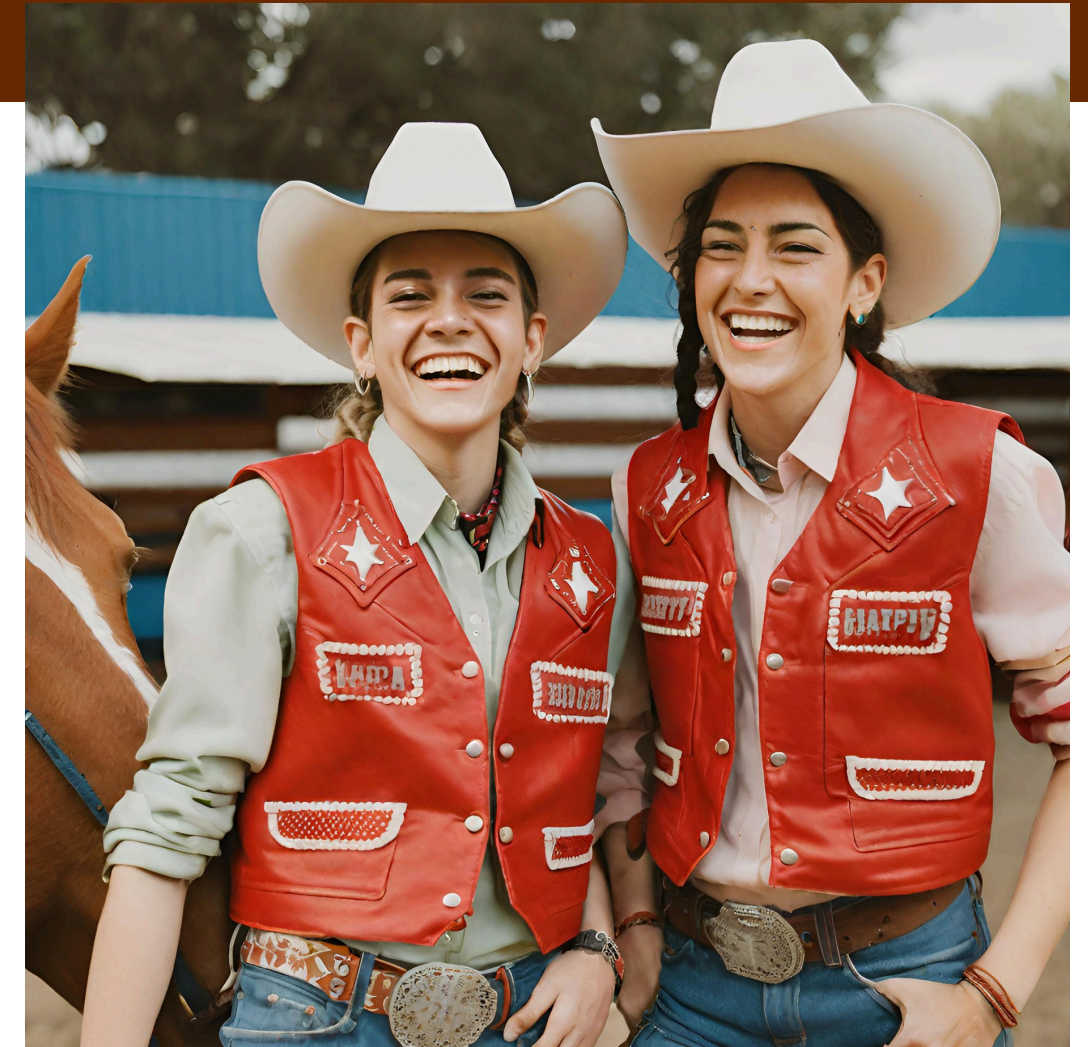
ECOLOGY PROJECT INTERNATIONAL