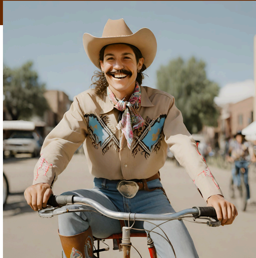
CITY OF MISSOULA - IT DEPT.