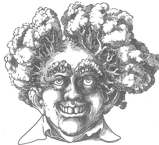
Rockin Rudy's Missoula, MT