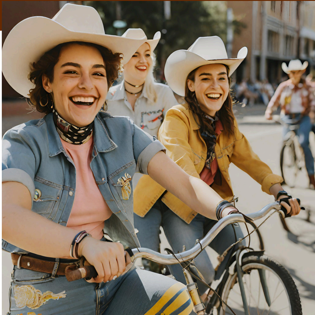
MISSOULA FOOD BANK